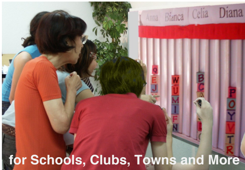
for Schools, Clubs, Towns and More

“This is the site for learning about democracy.”